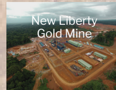
New Liberty Gold Mine